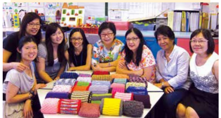
Project KNIT Committee