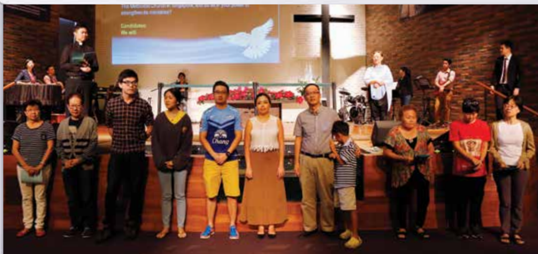
NEW TPMC MEMBERS