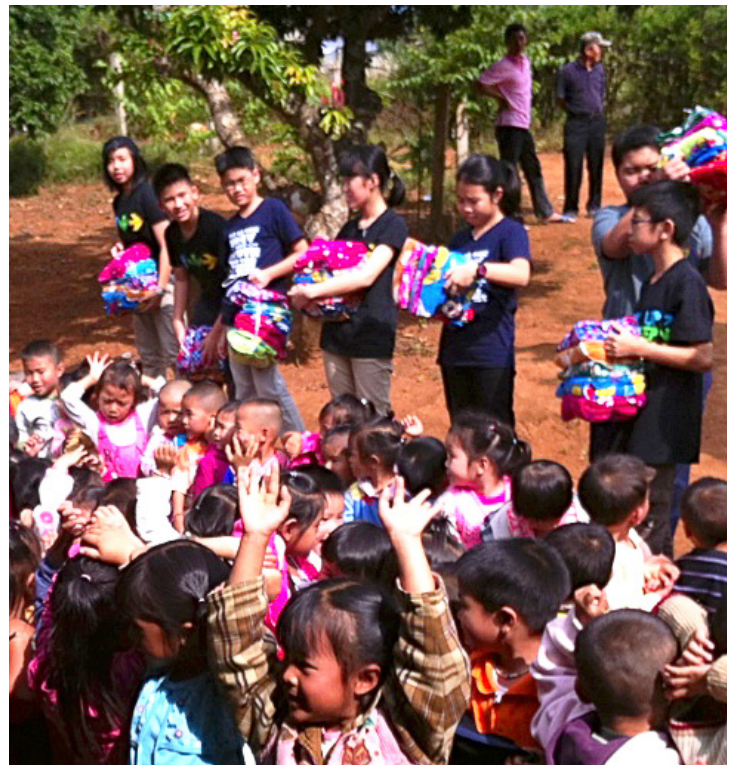
TPMC Primary 6 and Secondary 4 mission team distributing gifts to the children in a Shan refugee camp.

Please pray for wisdom as our co-workers bring the Gospel not just to Thailand but also to Myanmar and China. Pray that more Shan people will mobilise so that we can reach more villages for Christ! ■